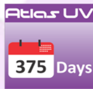
Lamp life remaining