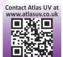
QR code screen