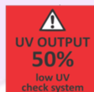
Low UV warning screen