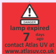
Lamp change warning